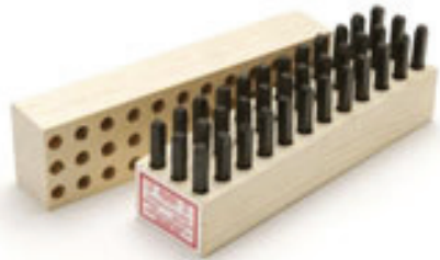
Steel Stamp Set