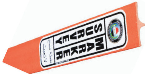
Carsonite Boundary Marker Post